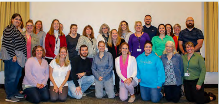
The Care Management Team from Cortland, Tioga, and Tompkins Counties say farewell

On June 30, 2019, we will say goodbye to the Service Coordination/Care Management Program for people with ID/DD at Racker. Service Coordination, in a variety of forms, has been an integral part of Racker for three decades in serving thousands of people with disabilities and their families.