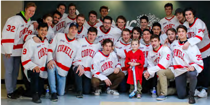
Members of the Men's Cornell Hockey Team take a photo at Racker with student from the Beetles Classroom