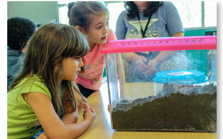
The Partnership Program enjoying a selection of bugs.