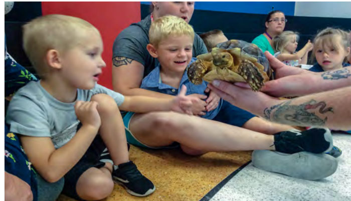
Children from the Tioga summer preschool program enjoy watching Tiny, an Agrican Sulcata Tortoise from Rosie's zoo.

For the past few summers, lucky students enrolled in our Tioga summer preschool classes have been able to participate in an enrichment program that has given them the opportunity to learn about art, dance, music, and more! This year, the program would not have been possible without the support of Visions Federal Credit Union.