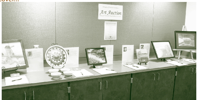
Silent Art Auction at Friends of Racker Luncheon