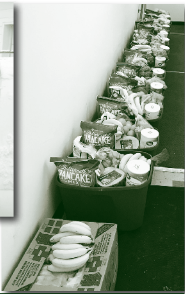
Right: Lipinski baskets lined up- waiting to be picked up!

As we celebrate seven decades of service to individuals with disabilities and their families, we recognize—now more than ever—that our ability to meet the evolving needs of our community relies not on our legacy alone, but on the legacies of those who support our vision of a world where all people know they belong.