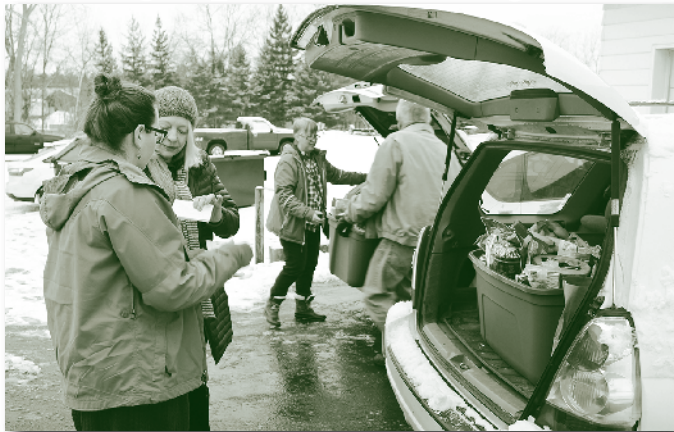
Above: Medicaid Service Coordinator's and program staff from each county help to distribute the gift baskets to families