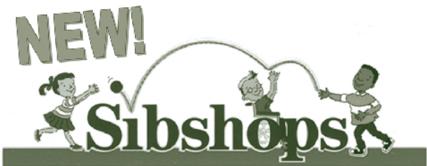
Workshops for siblings of children with special needs