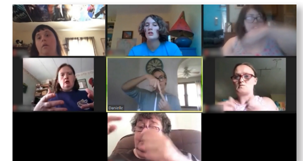
Interactive Hands - ASL Performance of "You Are My Sunshine"

The schedule can be found weekly at www.racker.org/events