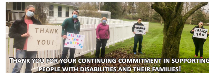
THANK YOU FOR YOUR CONTINUING COMMITMENT IN SUPPORTING PEOPLE WITH DISABILITIES AND THEIR FAMILIES!

Not only do DSPs take great pride in the work that they do, and is what drives them to keep coming back (even through blizzards and states of emergency) but the individuals and families they support take an even greater pride in the work of DSPs. Building a world where all people know they belong and actively creating opportunities for people to be connected in that world is more important now than ever, and we are thankful for the DSPs and CSPs who have shown us resilience and creativity in the midst of a pandemic. We are so grateful for you. 🌱