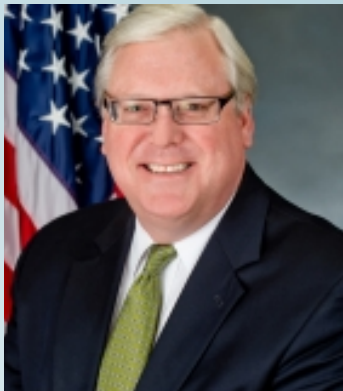
Senator Tom O'Mara

Assembly District 125 Tompkins and parts of Cortland Counties