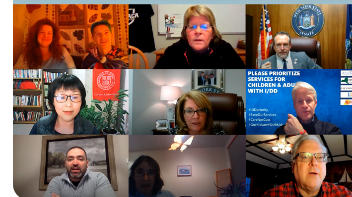
March 2021 Legislative Forum with Senator Akshar, Senator Oberacker, Senator O'Mara, & Senator Helming

You can help our advocacy efforts by visiting www.racker.org/advocacy